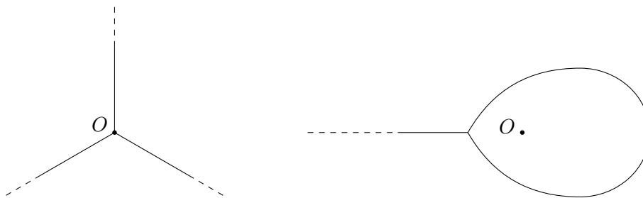
FIGURE 2. A standard triod and a Brakke spoon .

If one consider networks with only one triple junction, the only complete, embedded, regular shrinkers are given (up to rotations) by the “standard triod” and the “Brakke spoon” (first described in [4]), as in the following figure. Actually, the loop of the Brakke spoon is the only possible shape for a region of every regular shrinker (with any number of triple junctions) bounded by a single curve (and the curve “exiting” by such region is straight).