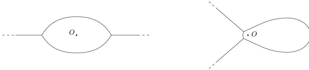
FIGURE 4. A lens-shaped and a fish-shaped shrinker.

It was instead unknown whether regular \Theta -shaped shrinkers (or simply \Theta -shrinkers) exist, with numerical evidence in favor of the conjecture of non-existence (see [7]). We are going to show that this is actually the case.