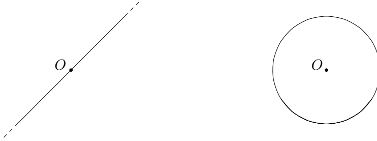
FIGURE 1. The only complete, embedded, self-similarly shrinking curves in \mathbb{R}^2 : lines through the origin and the unit circle.

The same equation \bar{k} + \gamma^\perp = 0 (that is, k + \langle \gamma | \nu \rangle = 0 ) must be satisfied by every curve of a network in the plane which self-similarly shrinks to the origin moving by curvature (see [14, 15], for instance). Moreover, for “energetic” reasons, it is natural to consider networks with only triple junctions and such that the three concurring curves (which are C^\infty ) form three angles of 120 degrees between each other – “Herring” condition – such networks are called regular . In such class, the embedded shrinking regular networks (without self-intersections) play a crucial role, indeed, they “reasonably” arise as blow-up limits of the motion of networks without self-intersections (this is still a conjecture for a general network, but there holds for networks with at most two triple junctions - see the end of the section).